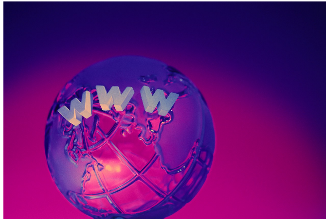
Figure 1. Figure captions are indented 5 spaces and justified. If you are familiar with Word styles, you can insert a field code called Seq figure which automatically numbers your figures.

Figures are centered. Use or insert .jpg, .tiff, or .gif illustrations instead of PowerPoint or graphic constructions. Captions go below figures. Indent 5 spaces from left margin and justify.