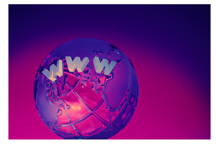
Figure 1. Figure captions are indented 5 spaces and justified. If you are familiar with Word styles, you can insert a field code called Seq figure which automatically numbers your figures.

Figures are centered. Use or insert .jpg, .tiff, or .gif illustrations instead of PowerPoint or graphic constructions. Captions go below figures. Indent 5 spaces from left margin and justify.